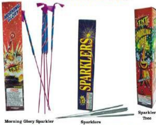
Sparkling Devices: MORNING GLORIES