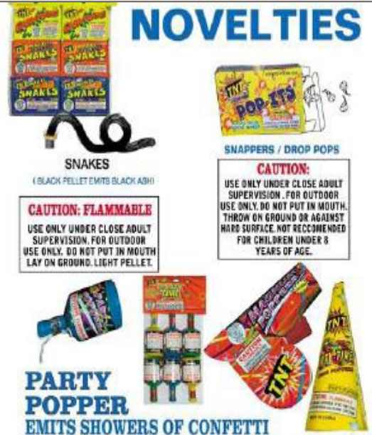
SNAKES (BLACK PELLET EMITS BLACK ASH)