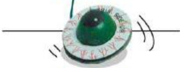
BALL & DISK

SPINS ON GROUND. EMITS FLAME AND SPARKS.